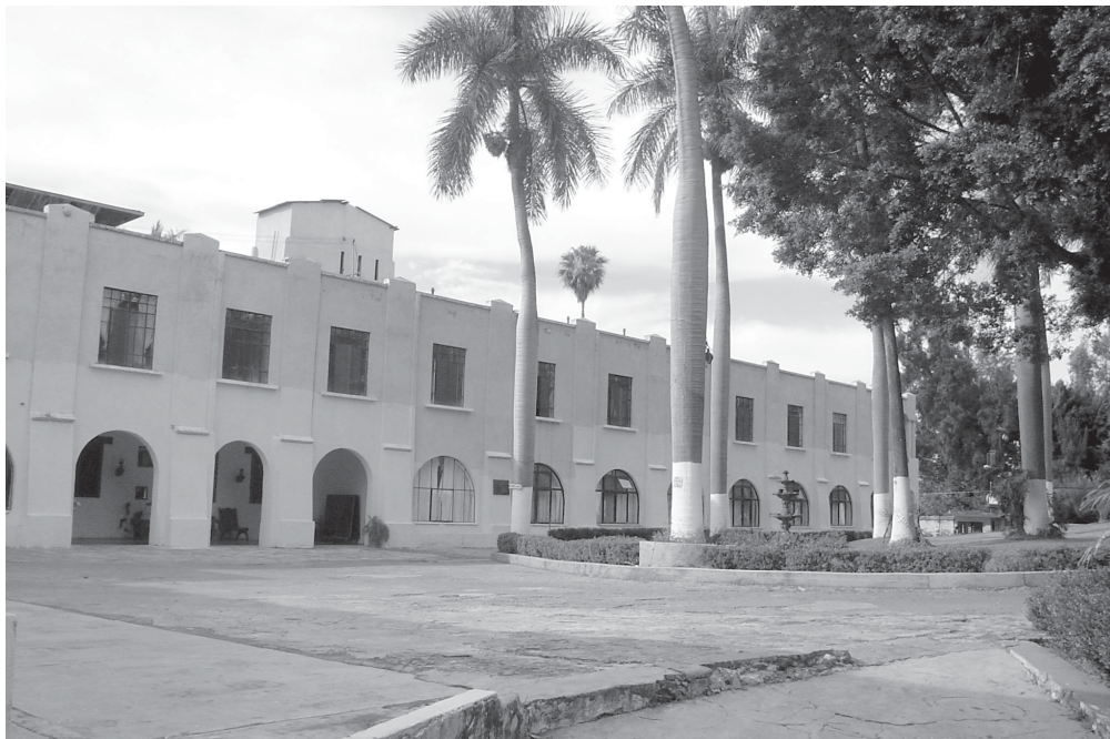
The third Exodus Latinoamérica Conference will be held at Centro Cultural Chulavista, Campus Crusade for Christ's center in Cuernavaca, México (above and below).

“My vision for gays in Nigeria and Africa, is to see individuals that will see themselves in the true state that God created them to be. This will entail setting up offices in most parts of our nation and partnering with other ministries with the same vision in Africa. It is not the will of God that any should perish, but that all should come to repentance. The gays should not perish in Jesus name. God who started this shall surely accomplish it in Jesus name. Amen.”